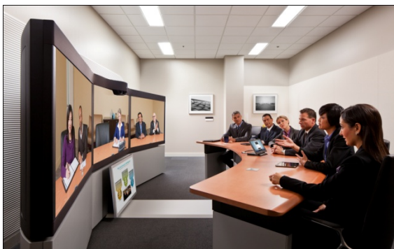
Figure 1. From the boardroom to the desktop, Cisco TelePresence solutions power the new way of working, where everyone, everywhere can be more productive through face-to-face collaboration.

Think beyond the boardroom. Companies of all sizes can streamline processes and increase sales with collaboration solutions. The broad Cisco TelePresence portfolio spans from video-enabled mobile phones and desktop systems for personal use to multiscreen, immersive solutions for large group meetings (Figure 1).